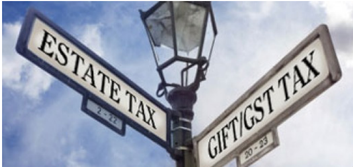
American Estate and Gift and GST Taxes

As a cross-border family lawyer in China, there are always clients from USA or China dealing with estates inheritance or asset transfer to United States. Very often, American tax issues are one of the core concerns. Thus, I have endeavored to take the trouble to understand American complex federal tax systems esp in regard of estate planning issues.