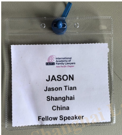
Badge at IAFL Brisbane Conference

It is always pleasant to be part of the IAFL AP chapter meeting, a chance to communicate, exchange ideas and have fun with peer family lawyers from other jurisdictions like Australia, Hong Kong, New Zealand, USA, Singapore, UK and even France.